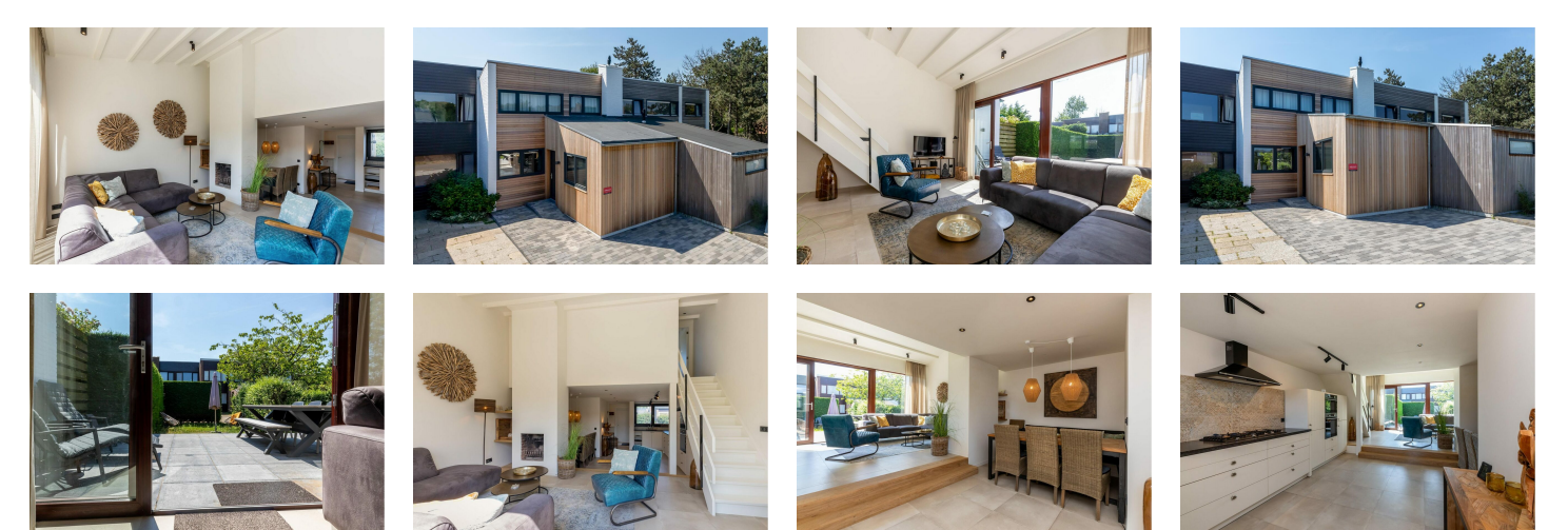
Welcome to Your Holiday Home

You can see the beautiful, open space this holiday home offers as soon as you step through the front door. The hallway looks into the open kitchen with an adjoining living room and leads to the bathroom and the first bedroom with a double box spring bed (160 x 200 cm).